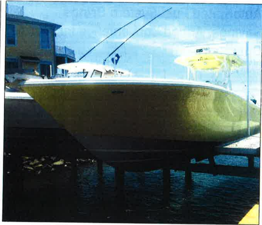
Ocean City Fishing Center in Ocean City, Maryland, cannot install boatlifts fast enough to meet the demand for them. It is installing 28 boatlifts at its slips, which are rented to annual slipholders as soon as they are complete.

"I'm astonished by the demand I've seen," he said. ⚓